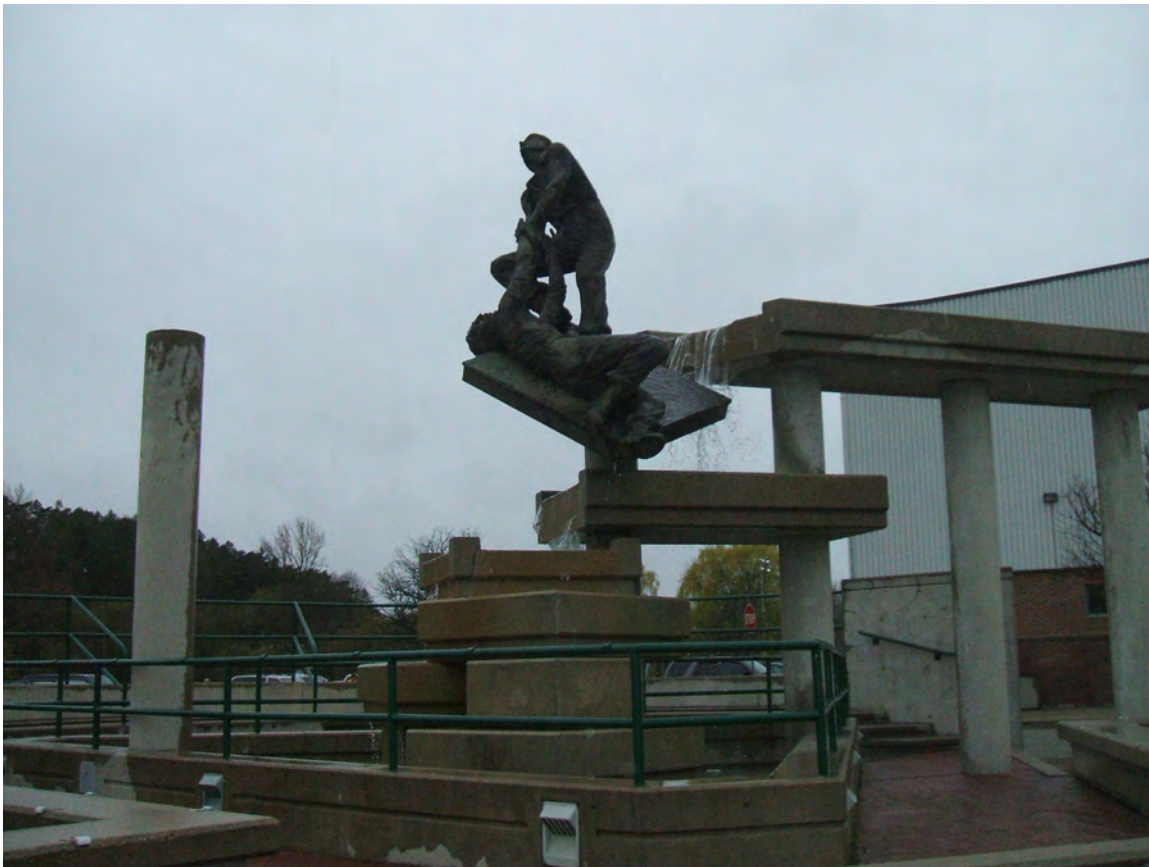
Monument in front of Woodbridge arena and pool – Highway 7 and Islington Ave

OPSEU members mark this day with sadness and pride. Sadness, because so many preventable deaths, injuries and diseases continue to strike workers down. Pride that OPSEU members have helped to make significant changes in the Occupational Health and Safety Act through participation in workplace safety and violence campaigns. The challenge for all of us is to strive to prevent death, and injury in the workplace. 🚧